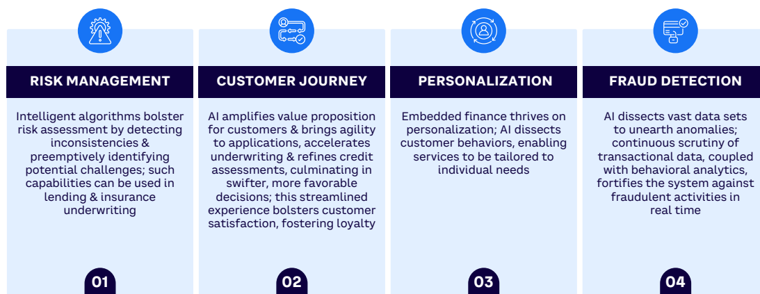
Figure 1. The multifaceted applications of AI in embedded finance

The essence of embedded finance is its comprehensive integration with nonfinancial platforms, ensuring that users can access and utilize financial services without disrupting their primary engagements. AI elevates this feature; its advanced personalization capabilities discern user needs before they become apparent.